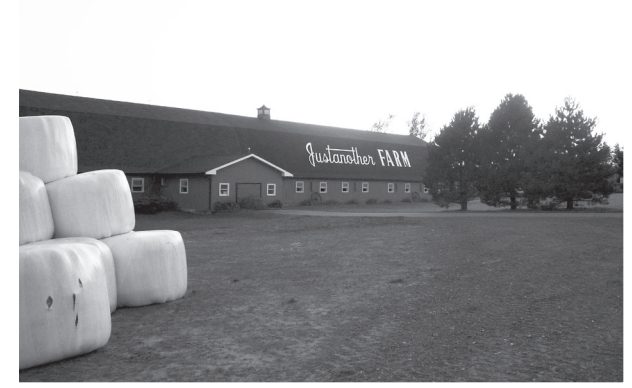
Just Another Farm photograph from the Lammerdings.

From there they turned westward with a bit more time spent with Ewald's parents in Ontario. 14,281 kilometers and 31 days later, they made it back to Saskatoon to find the harvest in full swing. All across Canada, it proves that the old adage is true: when it is time to reap what you have sown . . . get at it while the gettin' is good!